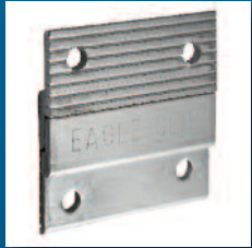
PANEL "Z" CLIP