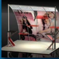
STORE FIXTURE AND DISPLAYS