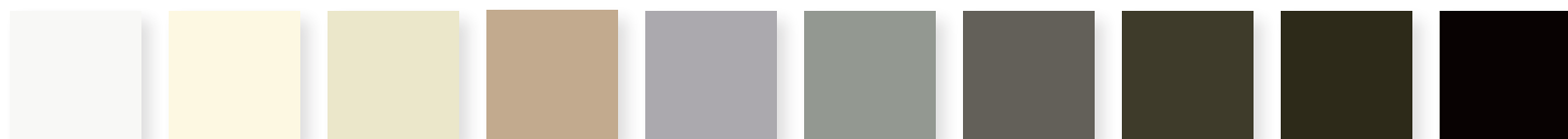
White PM5210 Cream PM5220 Almond PM5230 Khaki PM5240 Silver Gray PM5250 Light Gray PM5260 Dark Gray PM5270 Medium Bronze PM5050 Dark Bronze PM5060 Black PM5080